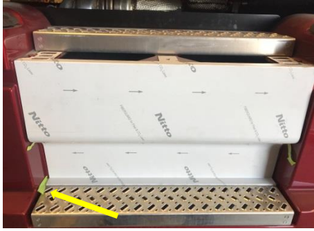
Figure 2. Guide Line Tape for Lower Panel Location