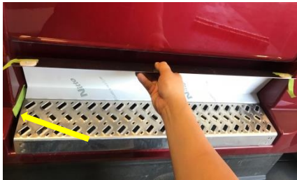
Figure 3. Place Lower Panel after Peel 3M Tape